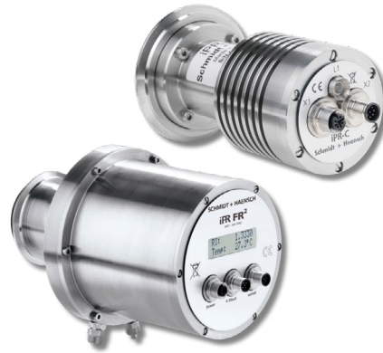
iPR C 2 Compact Inline Process Refractometer

Using the SCHMIDT + HAENSCH Full-Range Inline Process Refractometer iPR FR 2 or Compact Inline Refractometer iPR C 2 provide a robust, real-time method for monitoring the Urea concentration in AdBlue®/DEF production processes. The refractometer is installed downstream of the heat exchanger before storage or filling. It continuously measures the concentration and ensures it remains within the required range of urea. If deviations occur, the system automatically adjusts the dosage of demineralized water via digital output signals, ensuring consistent product quality. For batch production using urea granules, the refractometer can be installed directly in the mixing tank. It monitors the dissolution process and controls dosing in real time, enabling fast and efficient production.